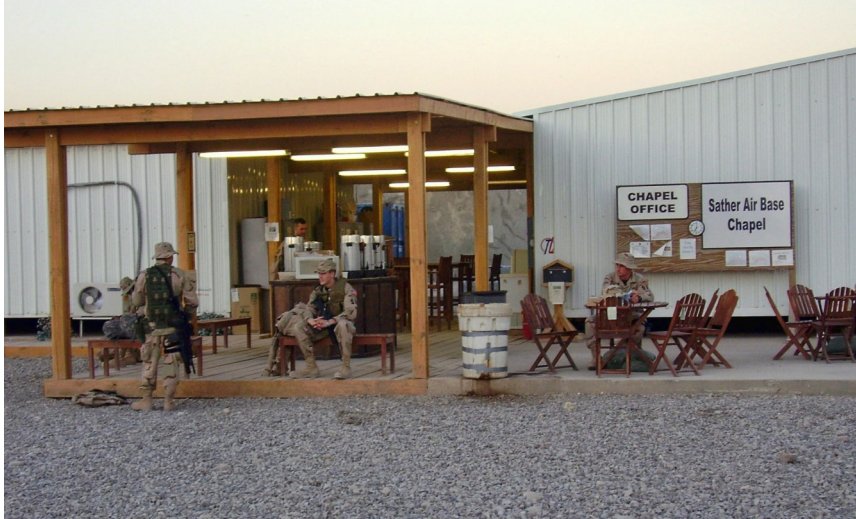
Holy Joe's first location at Sather AFB, Baghdad, Iraq - September 2006.

Since their humble beginning collecting cans of coffee they have grown to serve billions of cups of coffee and helped open over 300 coffee houses throughout the world, mainly in the Middle East but also in places like Africa, Europe, and even on board Navy ships and in NATO military hospitals, as well as small Forward Operating Bases, hangar bays, other hospitals, aid stations and any setting where they are needed.