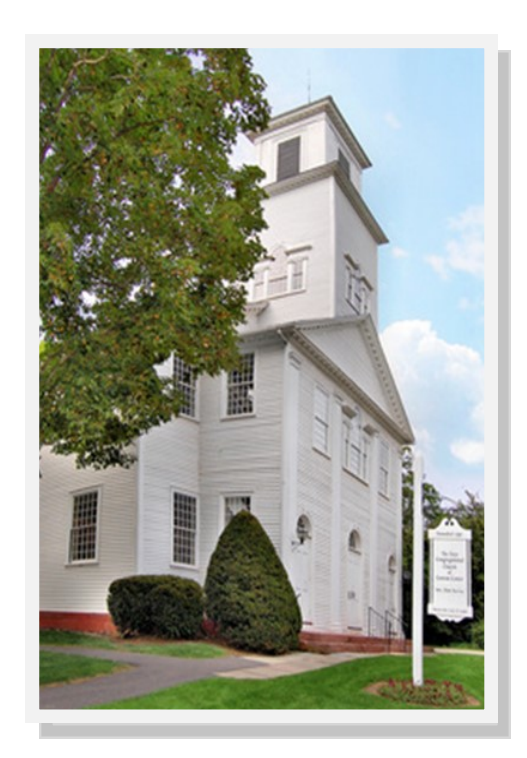
Worship every Sunday at 10:00 a.m.

The Churchmouse The First Congregational Church (United Church of Christ) 184 Cherry Brook Road P O Box 133