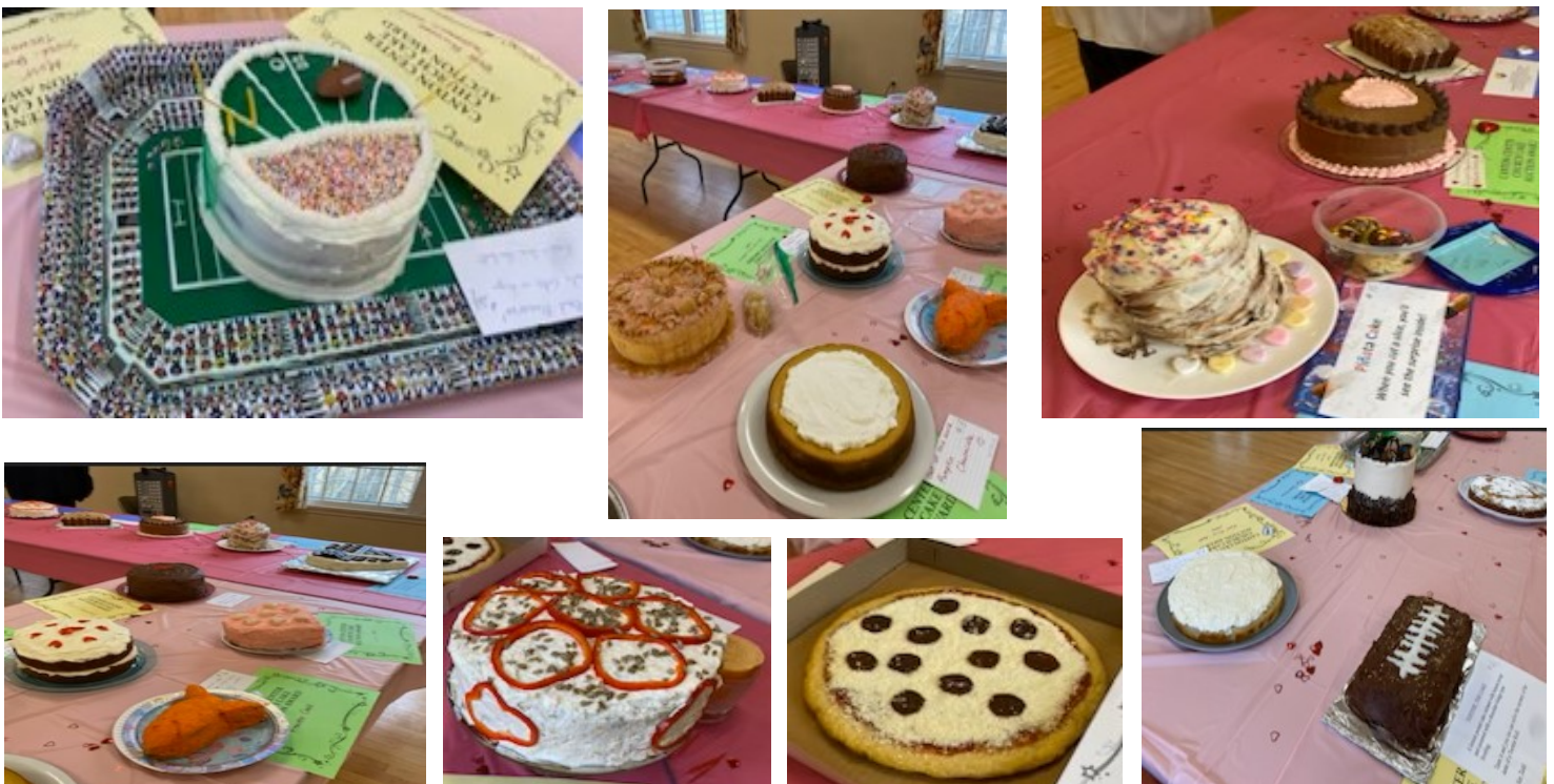
Photographs of our wonderful cakes prepared for our Cake Auction on February 11th.

Please join us on Palm Sunday after the service for the pot luck dinner.