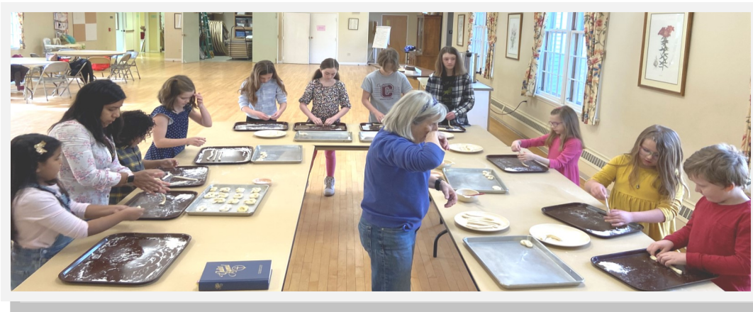
Having fun making pretzels Sunday, March 10th

Let us know that believing in and practicing abundance attracts more good. May it be so with us!