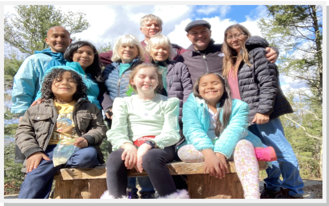
Happy Wanderer's Hike Sunday March 17th.